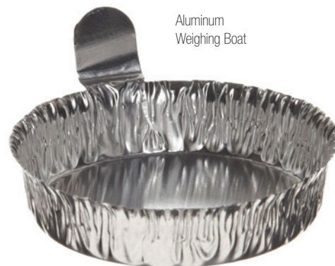
Aluminum Weighing Boat