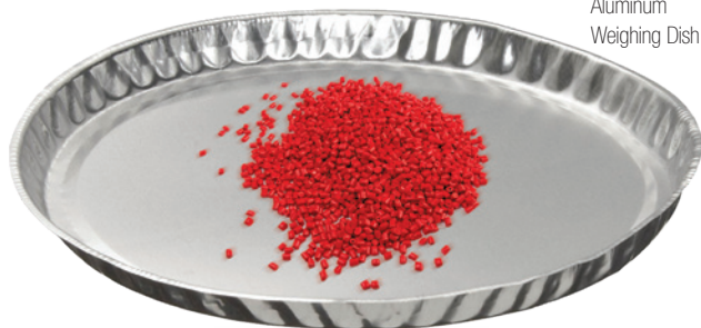
Aluminum Weighing Dish